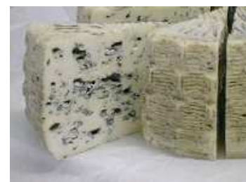
Mountain Goat Blue, made by Red Hill Cheese, VIC. For details contact: www.redhillcheese.com.au